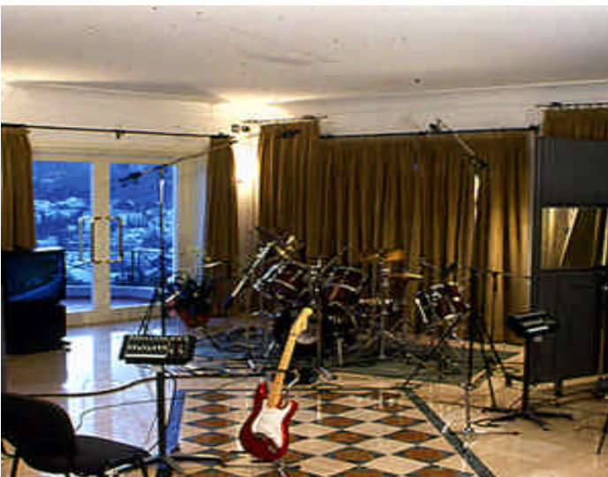
Live recording area