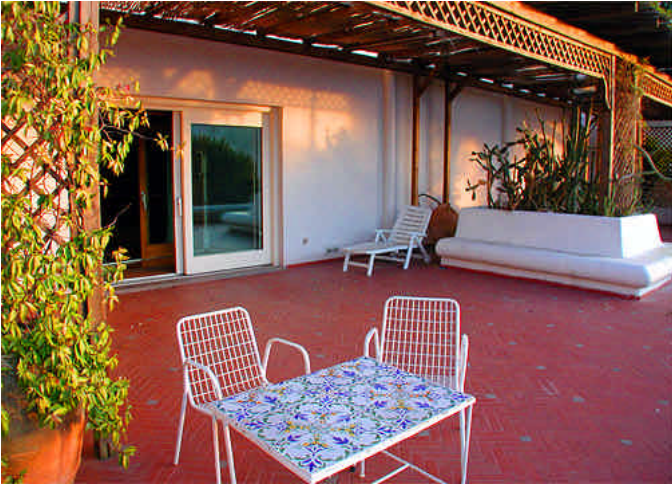
Terrace outside C.R.